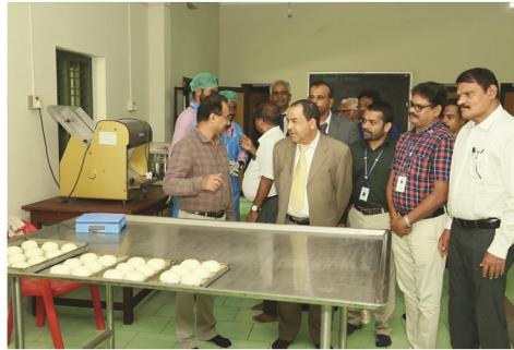
VC, UTAS, Oman visit to pilot plant