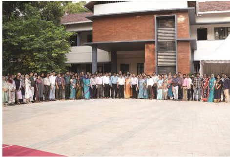
NAAC-Peer Team with Faculty