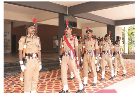
NCC Guard of Honour to NAAC-Peer Team