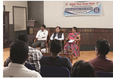
Stakeholder interaction with NAAC Peer Team