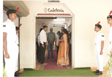
NAAC-Peer Team Visit to Canteen