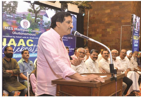
NAAC A+ Honoring