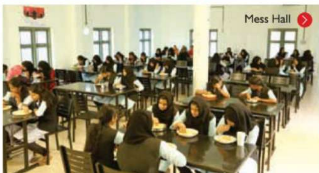
Mess Hall >