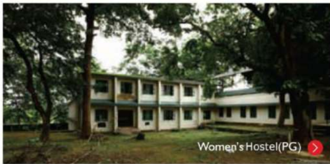
Women's Hostel(PG) >