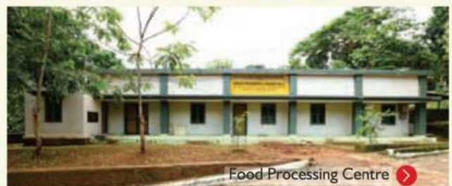
Food Processing Centre ➤