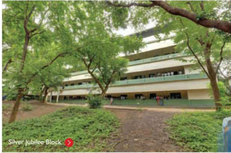
Silver Jubilee Block >