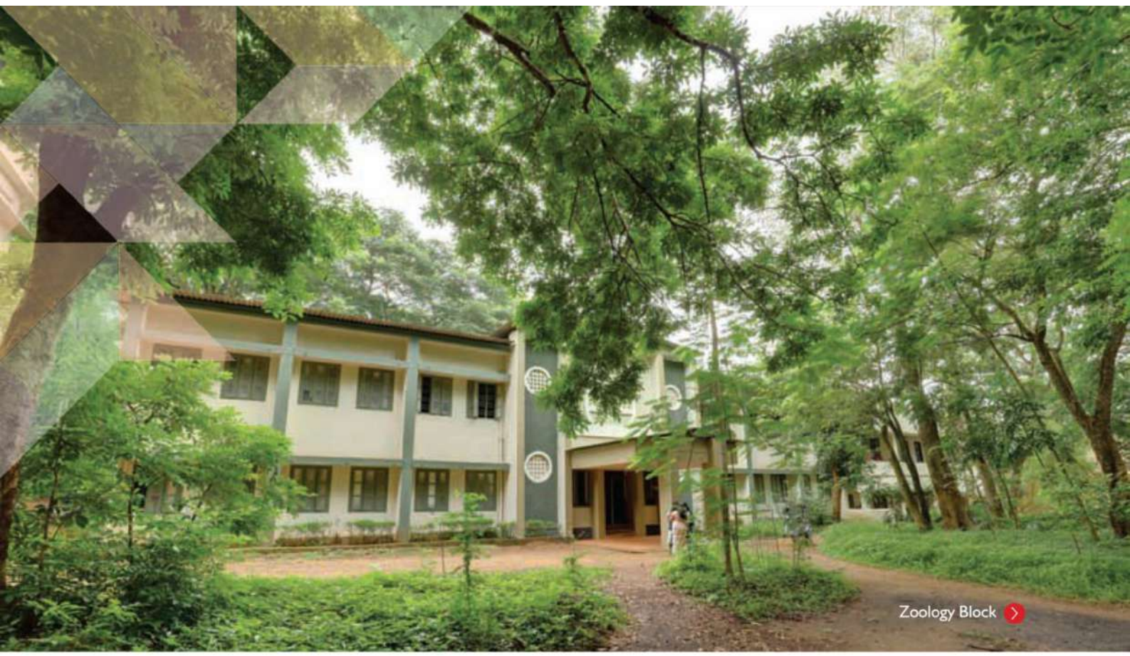
Zoology Block >