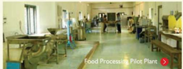
Food Processing Pilot Plant ➤