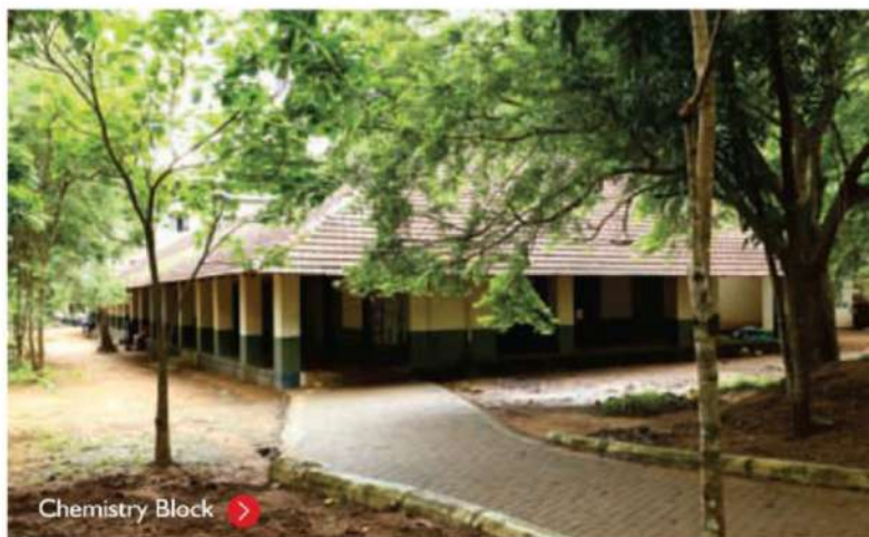
Chemistry Block >