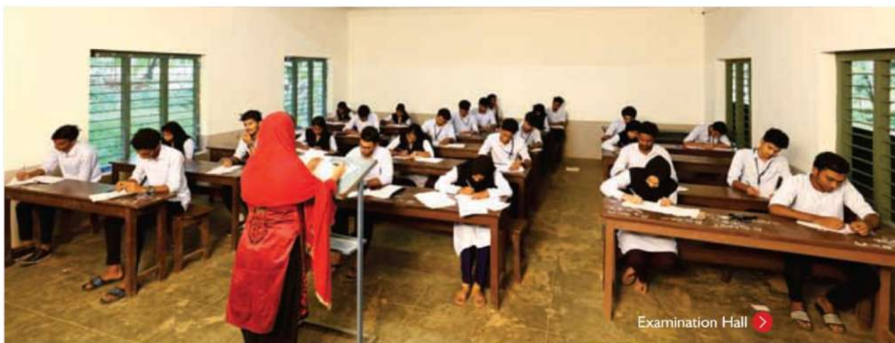
Examination Hall >

M.Sc. Food Science and Technology (Self financing)