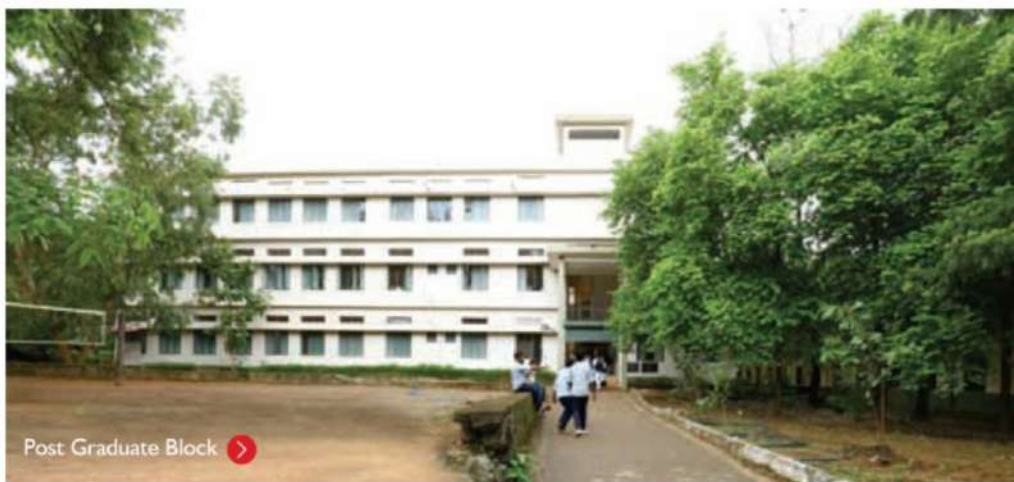
Post Graduate Block >