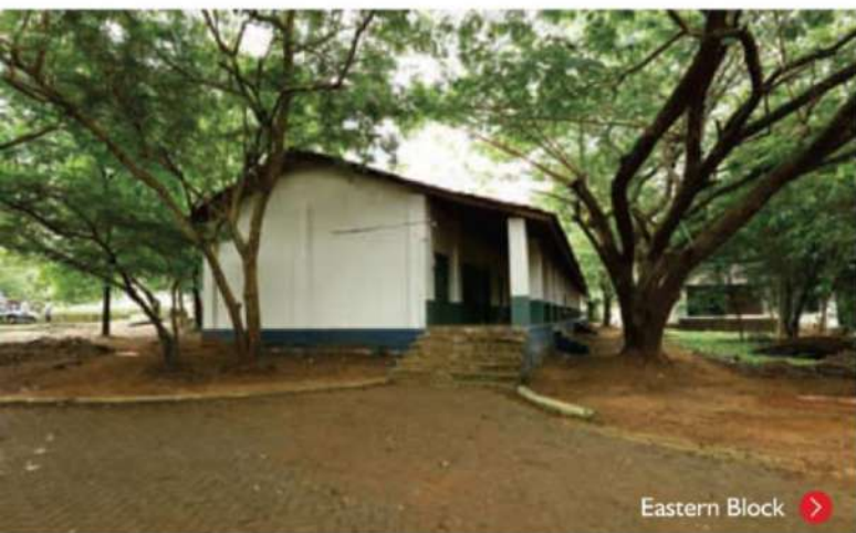
Eastern Block >