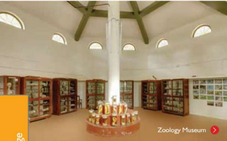
Zoology Museum >