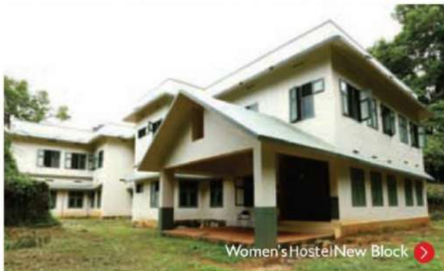
Women's Hostel New Block >