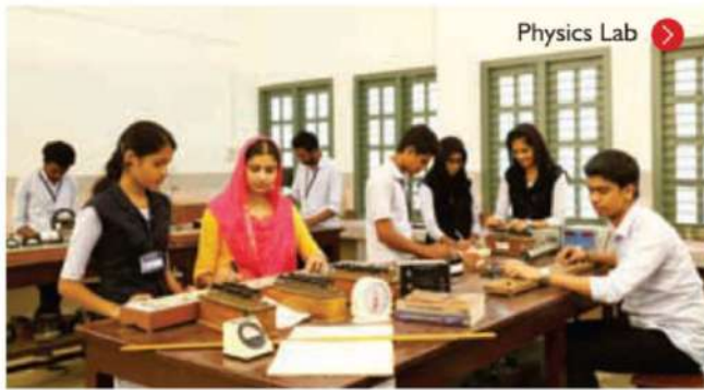
Physics Lab >