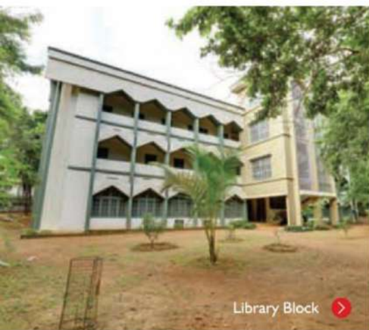
Library Block >