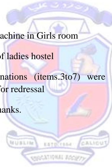
PRINCIPAL MES Mampad College (Autonomous) P.O. Mampad College